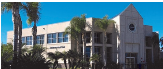
West Valley Detention Center - San Bernardino County, CA

Liberty Healthcare's "Restoration of Competency" program is based within the West Valley Detention Center and delivers timely and high-quality court-ordered forensic assessments, psychiatric stabilization, and restoration of competency services to adults within a jail setting.